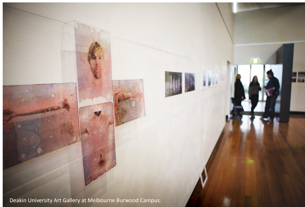
Deakin University Art Gallery at Melbourne Burwood Campus.

To request a copy phone Deakin International on +61 3 9627 4877 or email deakin-international@deakin.edu.au .