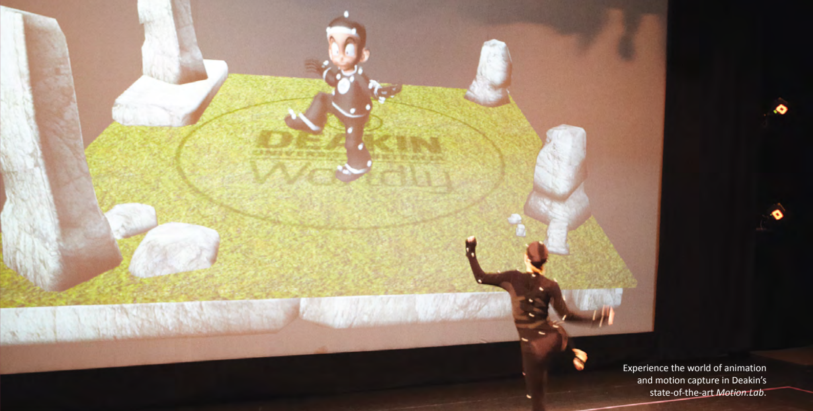
Experience the world of animation and motion capture in Deakin's state-of-the-art Motion.Lab .