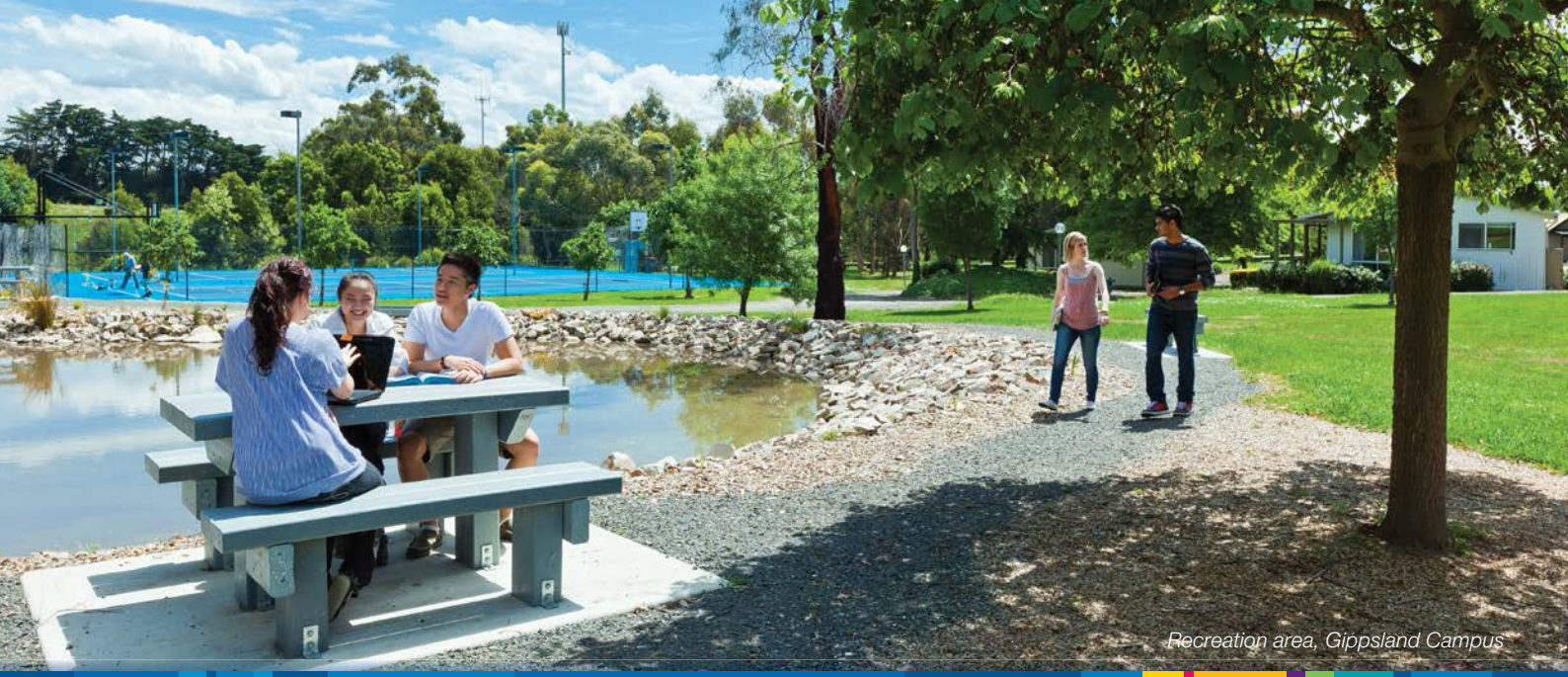
Recreation area, Gippsland Campus