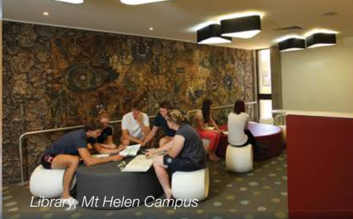
Library, Mt Helen Campus