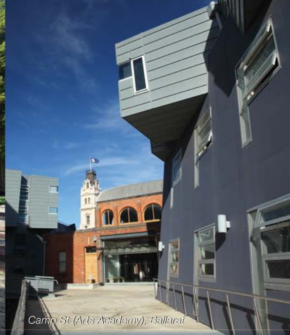
Camp St (Arts Academy), Ballarat