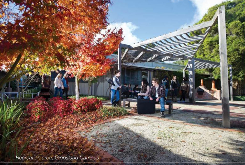
Recreation area, Gippsland Campus