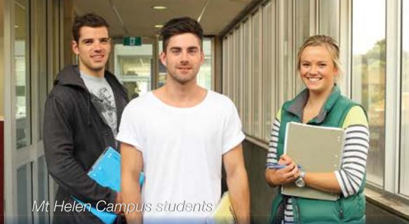
Mt Helen Campus students