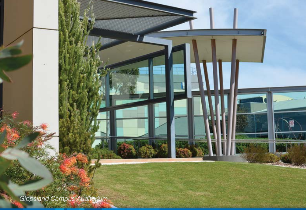
Gippsland Campus Auditorium