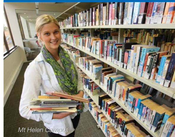
Mt Helen Campus